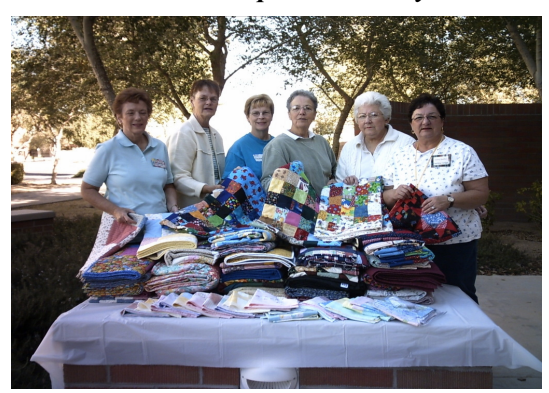
Sunbird Sunny Quilters brought over fifty blankets to the Spring Bee.

2004 Autumn Blanket Bee October 16, 2004, 9a.m.—3p.m Chandler Police Dept. Community Room