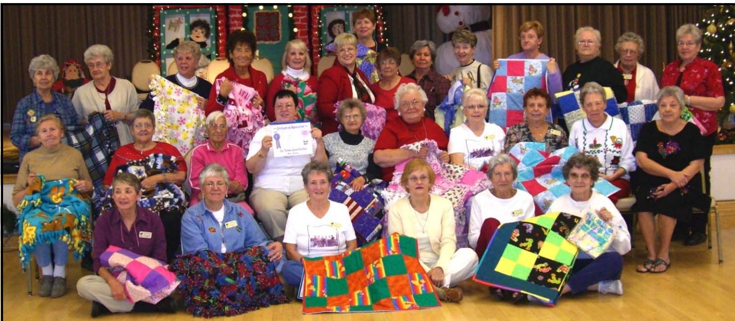
Below: Las Palmas Grand Quilters