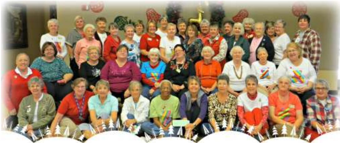
LAS PALMAS GRAND HOLIDAY LUNCHEON 2013

Las Palmas Grand holds its annual luncheon in December. In addition to being a working luncheon, this annual event is a time to reflect on the group's accomplishments for the year. In 2013, 2035 blankets were completed for AZB4K. Many of the Board members of AZB4K sew with this group and appear in the annual group photo above.