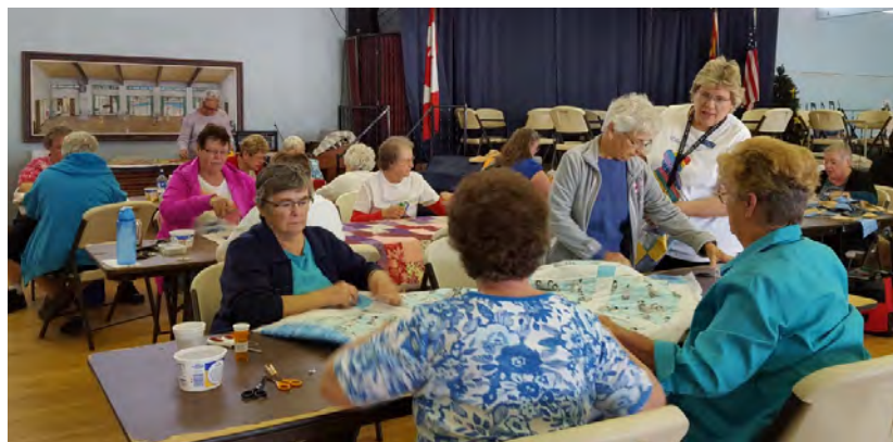
All of the tying ladies hard at work finishing lots of quilts