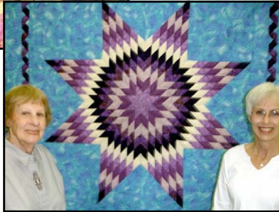
Above: AZB4K friends and Sun Valley Piecemakers at their Quilt Show

These ladies gave blankets, preemies, booties, caps and some stuffed animals with a total of over 400 pieces! Each worked all year and kept their stash of blankets hidden away until the quilt show. It wasn't until the night before the show that they would find out how many would be on display.