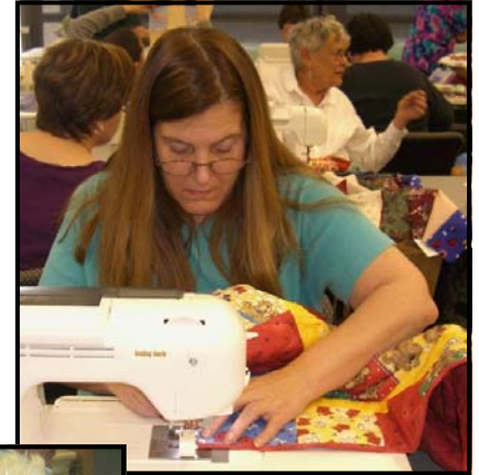
Above: A volunteer finishes an adorable dog theme quilt.

Many thanks to all our loyal volunteers for meeting us in a new place to do the same old thing that we always do because we love it so much. We know it takes extra effort to find us and maybe even a longer drive but we appreciate you more than words can say.