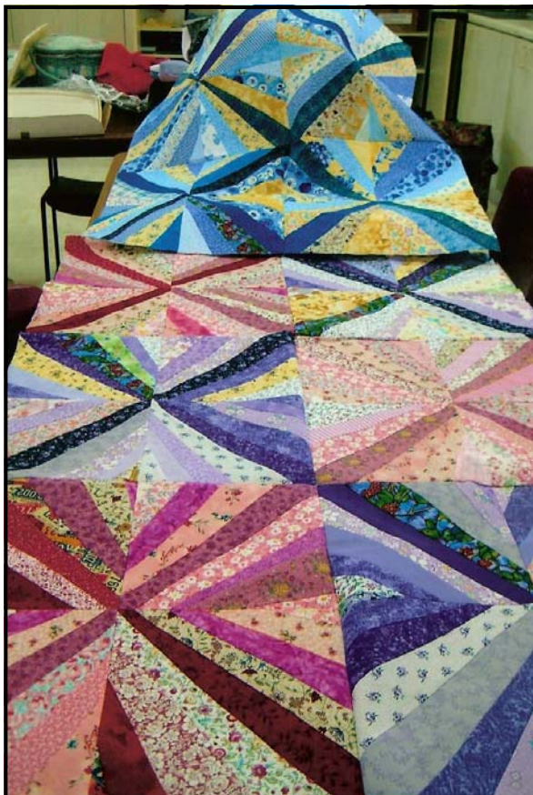
Below: A beautiful scrappy squares quilt