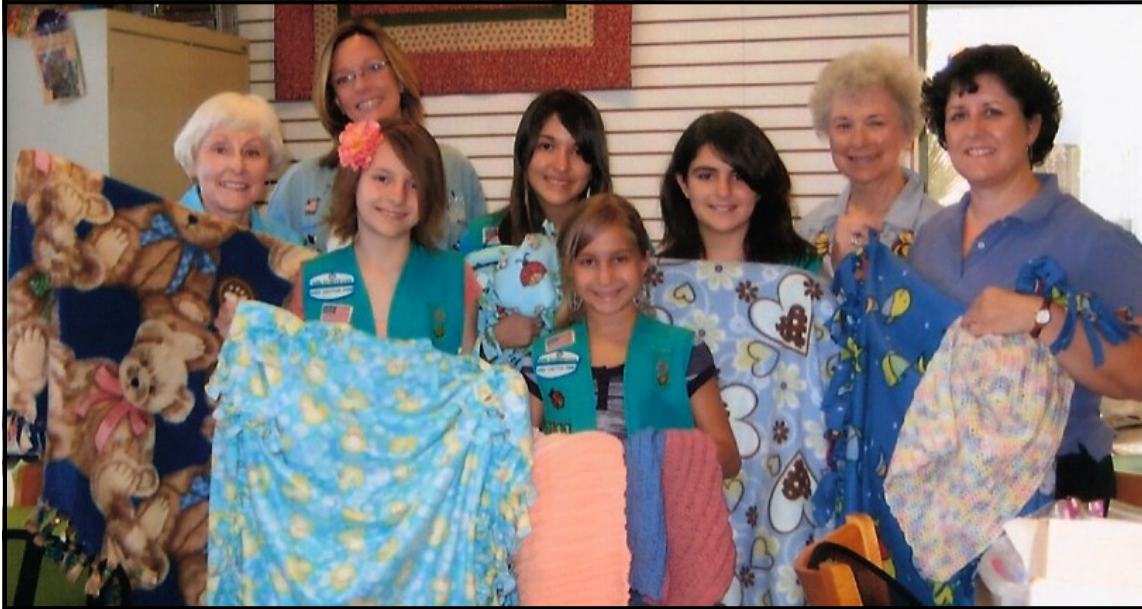
Left: Girl Scout Troop 2193 with their blankets and troop leaders.