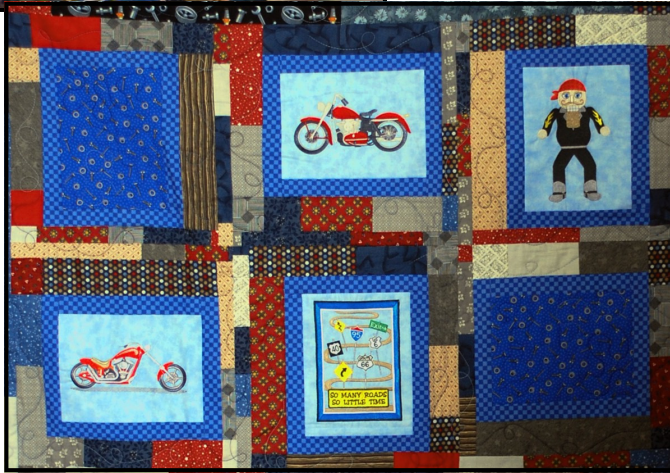
Right: Detail photo of the quilt.